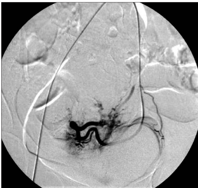
Figure 3. Arteriogram of the left uterine artery after embolization. Only collateral vascularization is seen.

ceased (Fig. 3). Right uterine artery embolization was performed in the same fashion. During this embolization, analgesics were administered to prevent pelvic pain. Two days after the embolization, curettage of the cervical canal was done with an estimated blood loss of 100 mL.