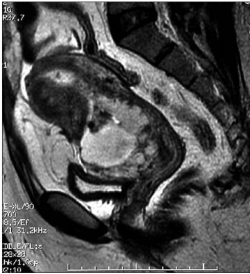
Figure 1. Sagittal T2-weighted MR image shows a heterogenous high-signal intensity mass that occupies the cervical anterior wall, which is very fine.